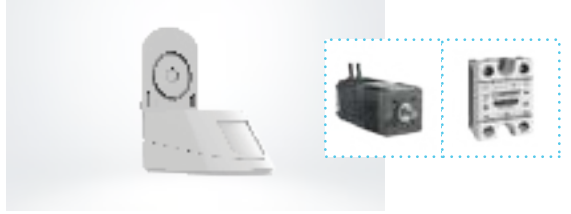
8 HOSPITAL BEDS SQ75 DCmind Brushless / GNBoard SSR